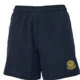
Sport Short unisex