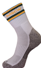
Sports Socks 2 pkt