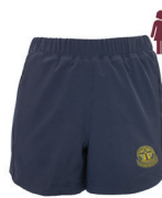
Sport Short with inner