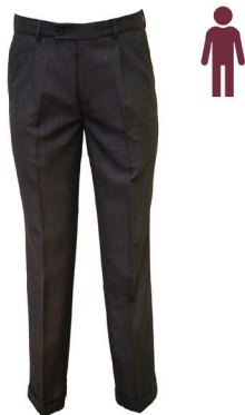
Trouser Pinhead Grey