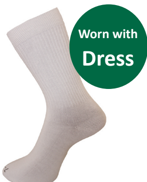
Sock Anklet White 2 pkt