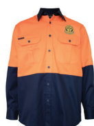
Hi Vis Drill Shirt