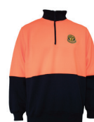
Hi Vis Windcheater

For current prices, please refer to www.bobstewart.com.au