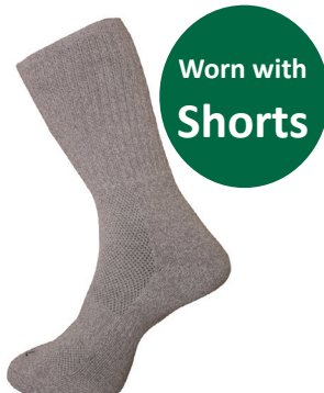
Socks Grey 2 pkt

For current prices, please refer to www.bobstewart.com.au