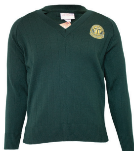
Pullover Yrs 7 - 9