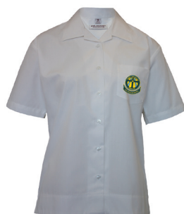
Blouse Short sleeve