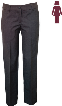
Pants Tailored Charcoal Poly/wool