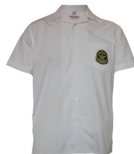
Shirt Short sleeve