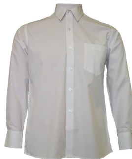
Shirt Long Sleeve