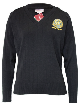
Pullover Yr 10 - 12