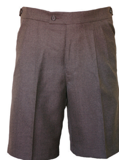
Pleat Shorts Pinhead Grey