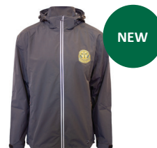
Jacket Wet Weather