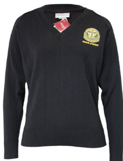
Pullover Yr 10 - 12