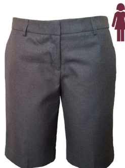
Tailored Shorts Charcoal Poly/wool