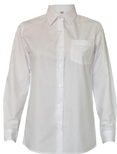
Blouse Long Sleeve