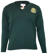
Pullover Yrs 7 - 9