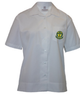
Blouse Short sleeve