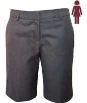
Tailored Shorts Charcoal