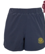
Sport Short Girls with inner