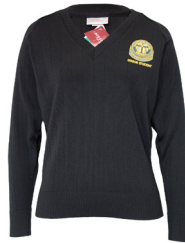
Pullover Yr 10 - 12