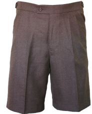
Pleat Shorts Pinhead Grey