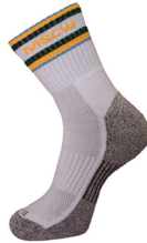
Sports Socks 2 pkt