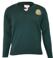
Pullover Yrs 7 - 9