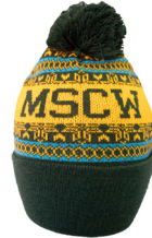
Beanie - NEW 2021