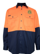
Hi Vis Drill Shirt