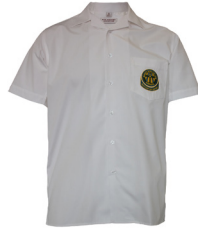
Shirt Short sleeve