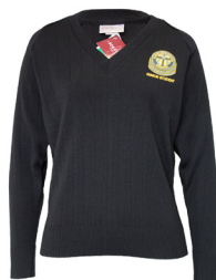
Pullover Yr 10 - 12