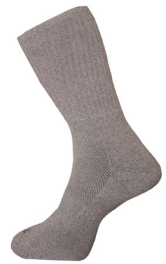
Socks Grey 2 pkt