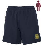
Sport Short unisex