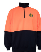
Hi Vis Windcheater