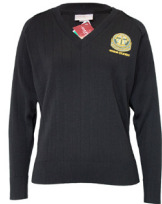
Pullover Yr 10 - 12