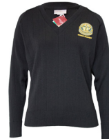
Pullover Yr 10 - 12