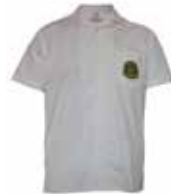
Shirt Short sleeve