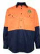
Hi Vis Drill Shirt