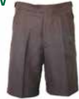
Pleat Shorts Pinhead Grey