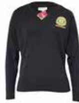
Pullover Yr 11 - 12