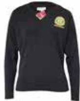
Pullover Yr 11 - 12