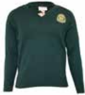
Pullover Yrs 7 - 10