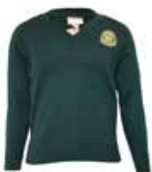
Pullover Yrs 7 - 10