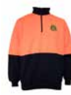
Hi Vis Windcheater