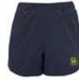
Sport Short Girls with inner