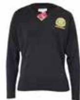
Pullover Yr 11 - 12