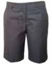
Tailored Shorts Grey