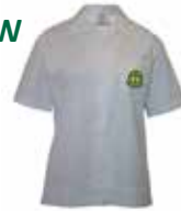
Blouse Short sleeve